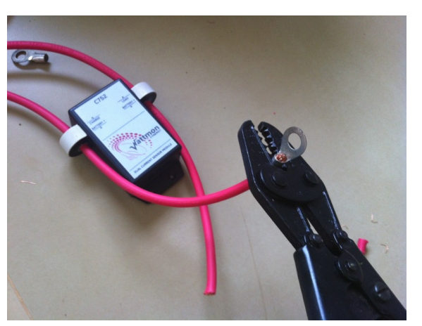
Figure 1.3 Crimping on the lugs

Next, strip the ends of both cables, insert the lugs, and crimp it with a crimping tool or a pair of strong pliers.