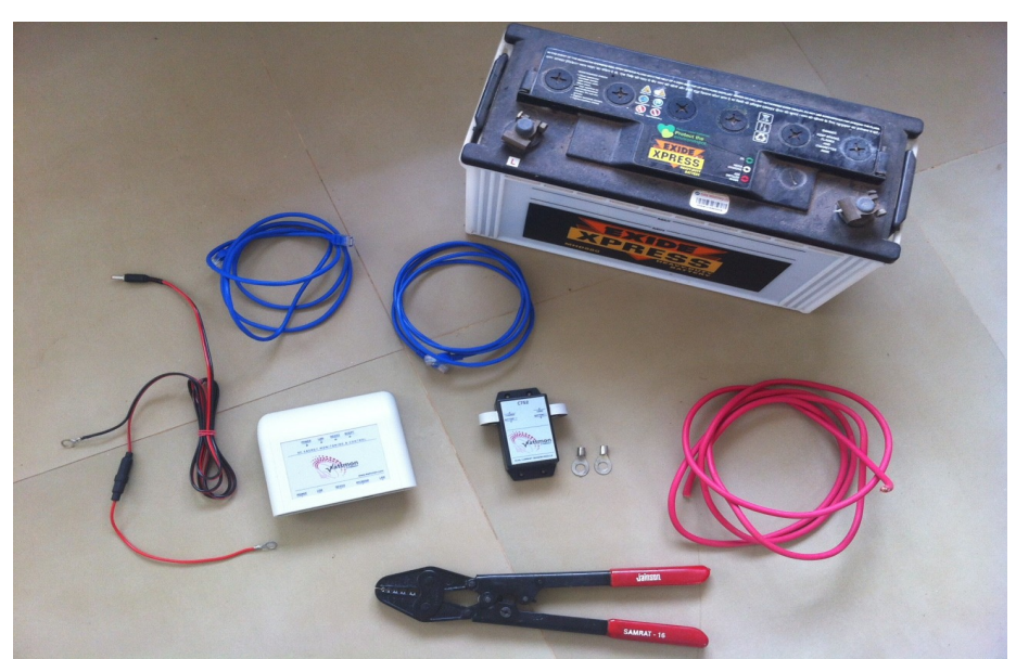
Figure 1.1 Wattmon solar monitoring components prior to hooking up with the battery